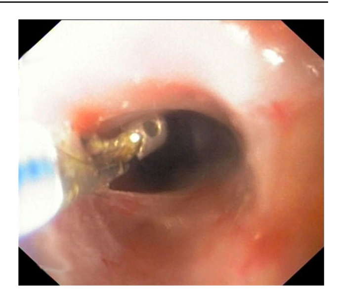
Fig. 3 Endoscopic view showing the oesophageal diameter after the second procedure. The forceps have a cup diameter of 7 mm

information the cat was asymptomatic up to 6 months after the last oesophagoscopy.